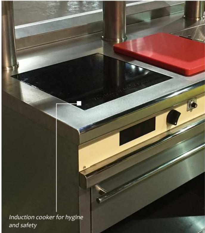
Induction cooker for hygiene and safety

Various styles are available including the clamshell design illustrated here. Features include: fully lockable and secure, in-built pumped water system, pull out hand wash basin on drawer slides, mobile lockable castors, fridge option, induction cooker option and lockable side compartments that open up.