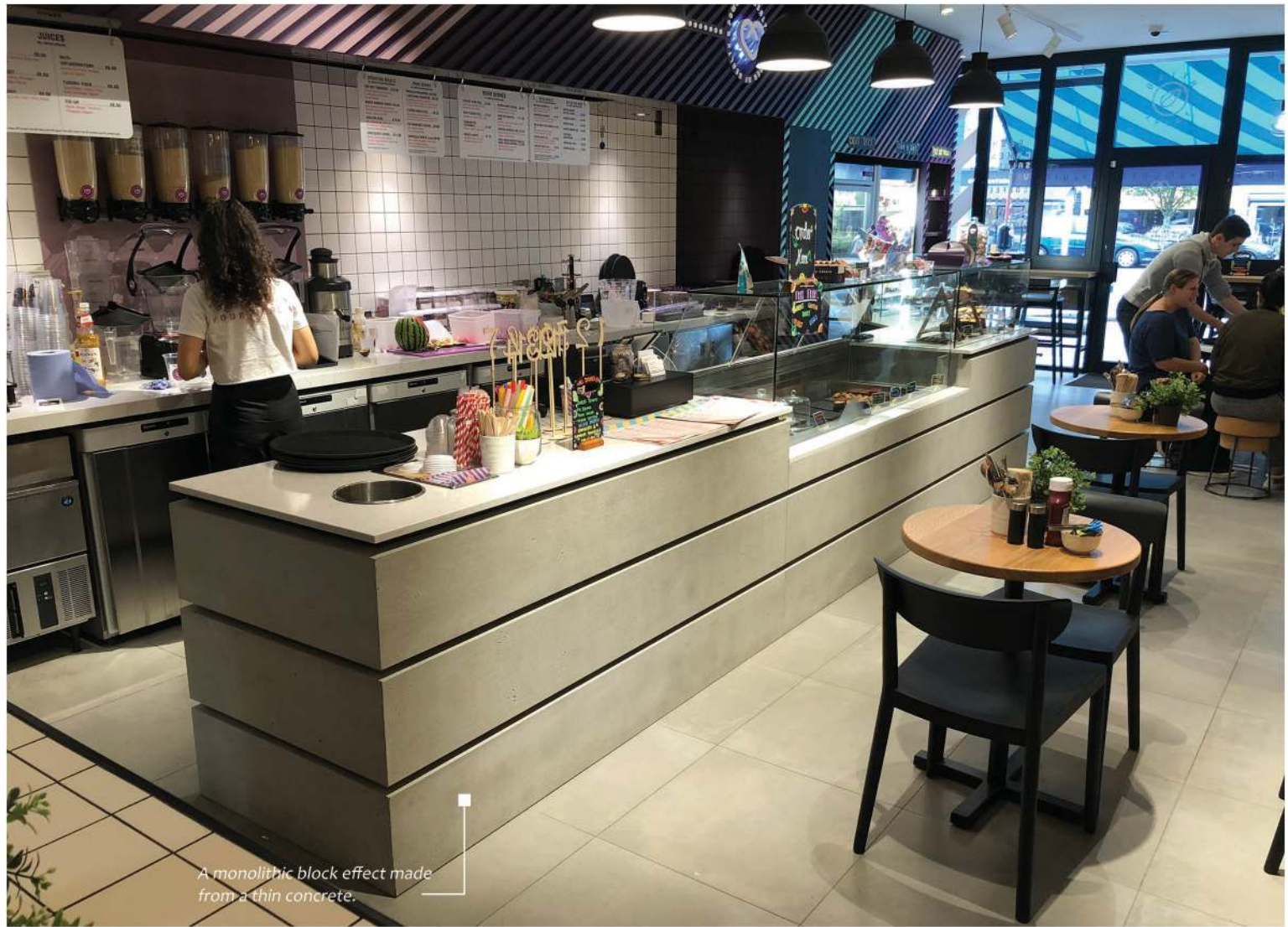
A monolithic block effect made from a thin concrete.