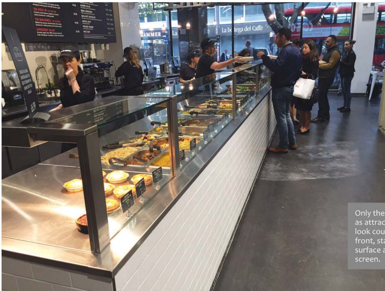
Only the food itself looks as attractive as the new look counter with tiled front, stainless steel surface and stylish glass screen.