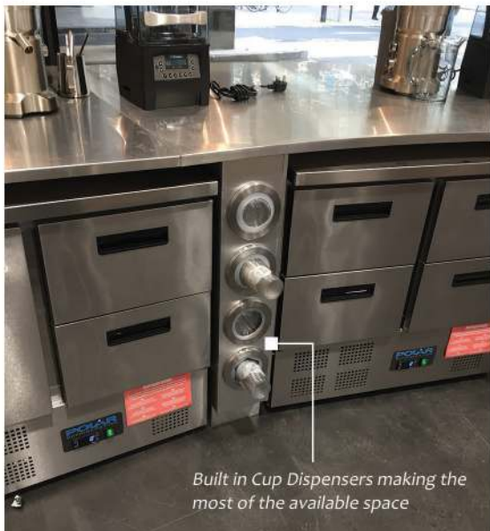
Built in Cup Dispensers making the most of the available space

Working to an exceedingly tight time frame, necessity really was the mother of invention. Stellex designed, manufactured, delivered and installed not only a hot display counter and a refrigerated display counter, both with a very stylish tiled front wall and unique glass screen design, but also created a whole new pioneering style.